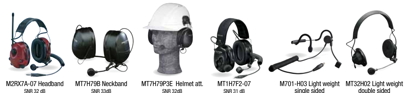
M2RX7A-07 Headband SNR 32 dB

A variety of options so you can select the right model for your workplace, see examples below.